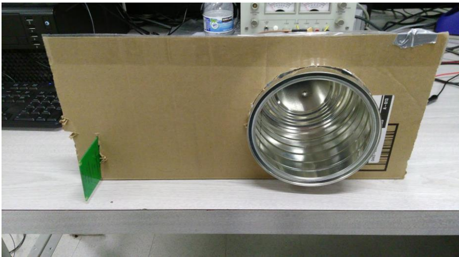
Figure 4. Final Antenna configuration

In summation, antenna choice should not be a teams primary concern. The goal of the project is to construct a working a radar and the cans will work fine for that purpose. However, that does not mean that the topic should be ignored by any of the teams. Acquiring suitable antennas and doing some experiments, given that your system works, provides an easy way to see a significant improvement in system performance.